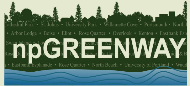
Eastbank Esplanade to the Columbia River