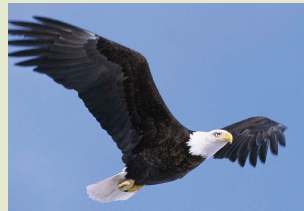
From below, the bald eagle's white head and tail may be invisible against a pale sky

The spirea is blooming with fuzzy, pink spires. I have native western red columbine. Monkey flower and Oregon sunshine make a sunny, yellow corner of the garden. In deeper shade, under the red twig dogwood, and between the spirea and yellow flowering currant, I have