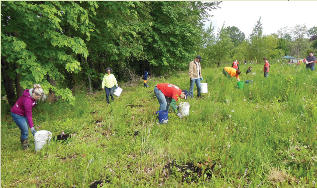
Work party in Baltimore Woods Meadow

November 7, Saturday, 1-4 – Volunteer work party at Nob Hill Nature Park (NHNP) in St Helens. Help maintain an oak woodland. Bring water and snacks. Meet at the wastewater treatment plant, 451 Plymouth Street in St Helens. Pre-registration is requested by Friday, November 6 by calling SBWC at 503-397-7904, or by e-mail to info@scappoosebay-wc.org .