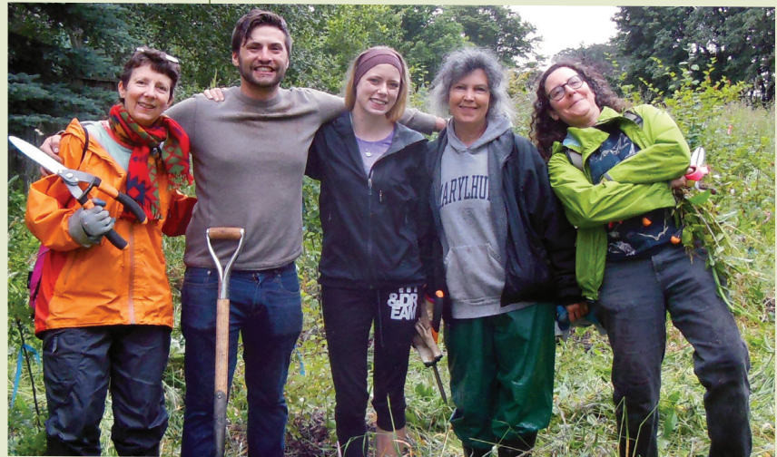
Golden Hour weeders

This year, FoBW started holding weekly work parties on Monday, May 4. Running for just one hour on Monday evenings, the work parties have accomplished restoration and maintenance goals in both sections of Baltimore Woods Meadow throughout the summer. The primary goal has been to identify significant native plants and mark them, then clear free space around them and mulch heavily. Mulch helps retain moisture and suppress weeds. Some of the plants we're marking are goldenrod, lupine, checkermallow, and native shrubs and trees such as ocean spray, vine maple, thimbleberry, Oregon grape, white oak, and cascara. The invasive plants we've been removing include thistle, peas, blackberry, and English ivy.