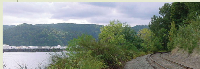
The North Portland Greenway Trail runs through Baltimore Woods and Baltimore Woods Meadow

In 2014 npGreenway secured a $50,000 Metro grant to build its capacity to achieve trail