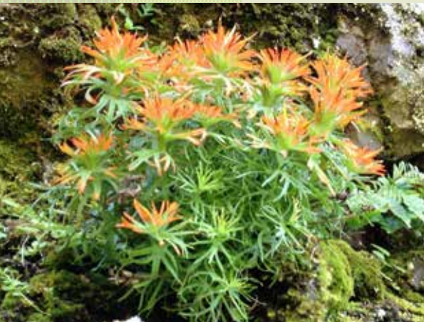
Castilleja rupicola (cliff paintbrush), beloved by hummingbirds (and people)

plants. Our focus unfolded with the seasons, from the early, low-elevation bloomers of the Gorge, up into the Coast Range, to high summer in the Cascades, and out to the coastal dunes late in the season.