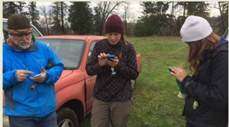
Dig In training for new FoBW restoration captains

The nonprofit Portland Parks Foundation and PP&R planned the return of Parke Diem, the city's largest annual volunteer event, for October 15, but sadly, the work party had to be cancelled