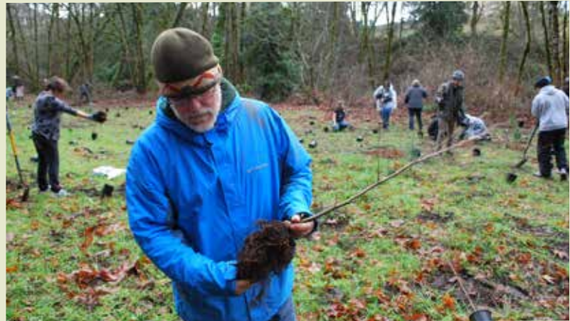
Dig In training for new FoBW restoration captains

include maintaining landowner and regional partnerships, creating site restoration plans, and offering community service-learning restoration opportunities. Prior to his work with Dig In, he worked at SOLVE and the Oregon Department of Fish and Wildlife (ODFW).