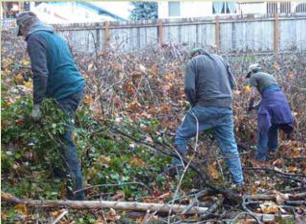
No Ivy Day 2016

This year makes the 13th annual No Ivy Day. It took place at 18 different natural area parks