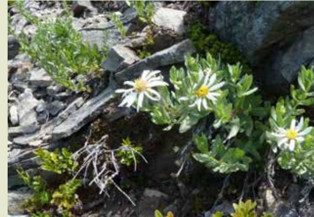
Populations of Gorman's aster hadn't been revisited for 25-35 years

What a time we had, before all the fall rain! In this, our first season of Citizen's Rare Plant Watch (CRPW), we took eight groups to beautiful places throughout our region. We couldn't have asked for sweeter weather, plant-geekier volunteers, or more lovely