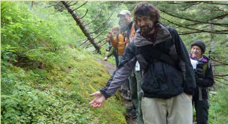
Volunteers put in a lot of effort and had a lot of fun botanizing

plants. Our focus unfolded with the seasons, from the early, low-elevation bloomers of the Gorge, up into the Coast Range, to high summer in the Cascades, and out to the coastal dunes late in the season.