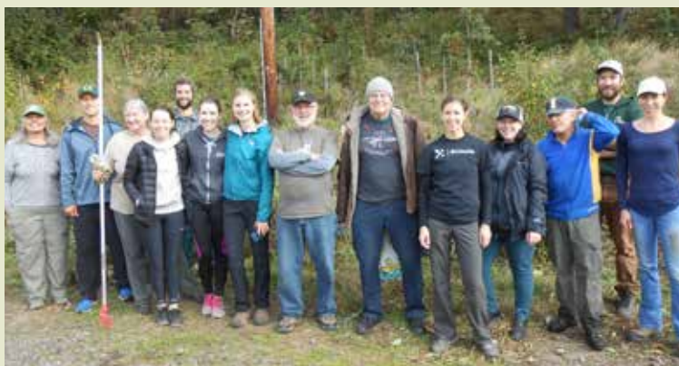
SOLVE's annual Beach and Riverside Cleanup Day

remove weeds and tidy up at the Baltimore Woods gateway near Cathedral Park Place. This event was part of SOLVE's annual Beach and Riverside