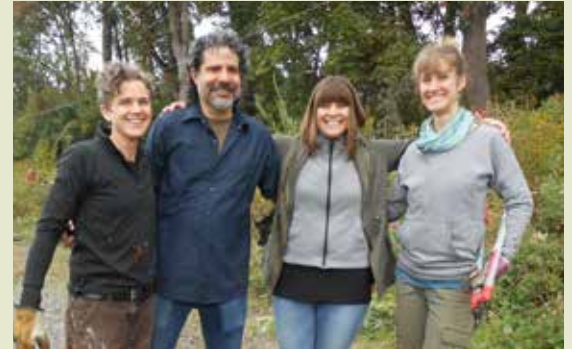
SOLVE work party

around the Portland-Metro area, including 25 people working at Baltimore Woods. After the ivy removal parties, participating volunteers enjoyed a free lunch and a raffle. Those who registered in advance also received a free native plant to take home from the event.