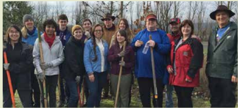
Columbia Slough volunteers

Historically, native peoples used the Slough waterways for seasonal fishing and hunting and safe canoe passage. In 1805, at the