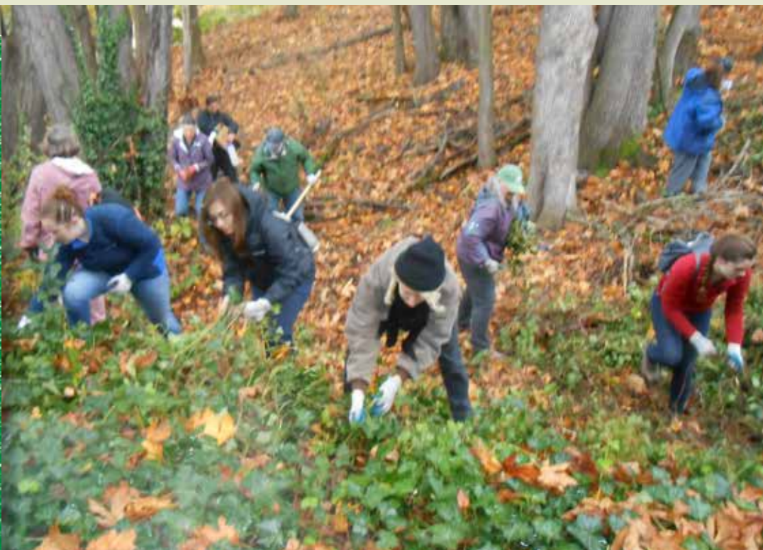
No Ivy Day 2016