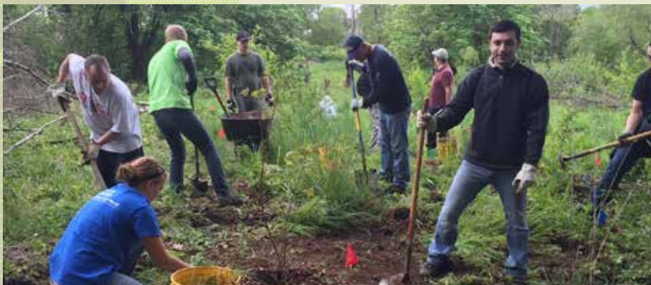
Columbia Slough Watershed Council volunteers

Today, this urban watershed provides recreation, greenspace, drainage, and habitat. It is home to 4,200 businesses, 170,000 people, a marine terminal, and two airports. The watershed collects stormwater runoff, rainwater, and groundwater. Its streams,