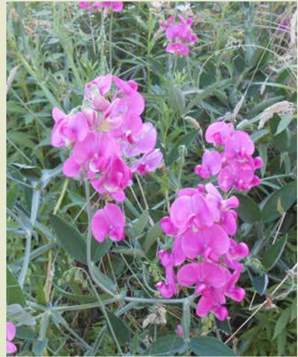
Pea vine – pretty, but pretty invasive

She has extensive training in the use of pesticides and herbicides. To her credit, she advises using them sparingly, if at all. However, not once does she mention