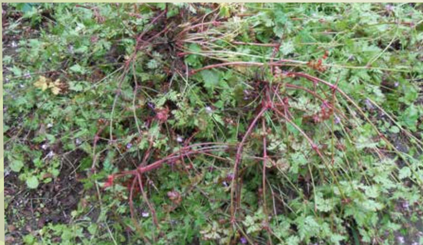
Reddish stems help identify Herb Robert

Least Wanted is an ongoing series sharing information about invasive plants of concern