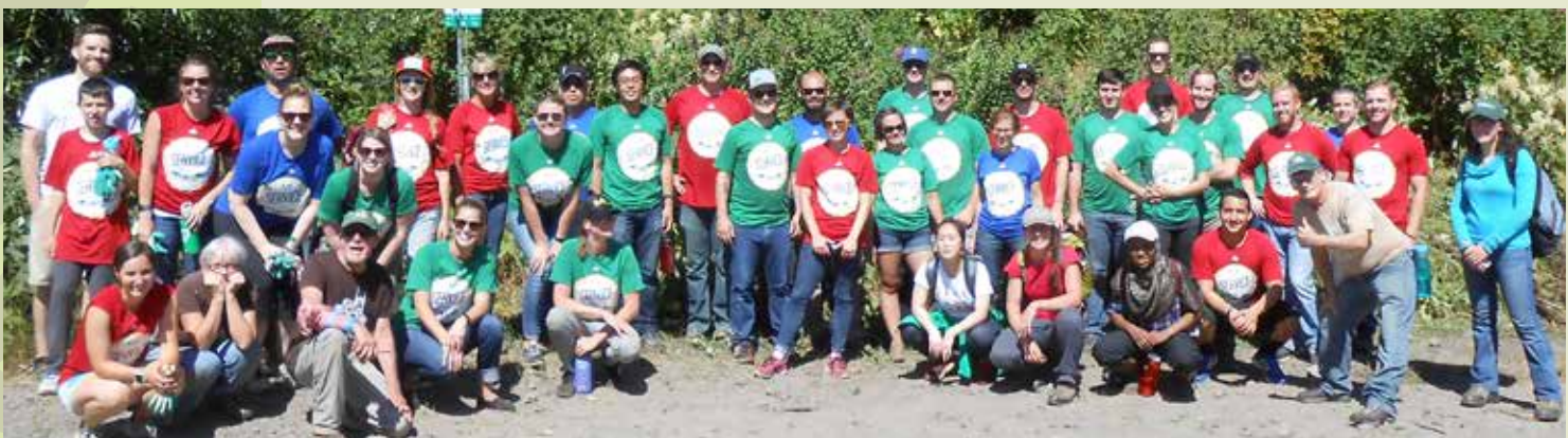
Service, Sports, and Suds volunteers in Baltimore Woods

SOLVE, in cooperation with the Portland Trailblazers, the Timbers, and Widmer Brewing, unleashed an army of volunteers on June 29