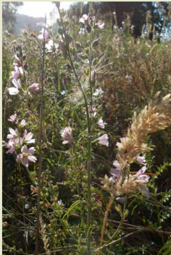
Sidalcea in Baltimore Woods Meadow

We've had a full summer of Thursday evening work parties at Baltimore Woods. From fall through spring, we hold our work parties on selected Saturday mornings. In summer, we shift to easy, one-hour weekly events on those lovely, warm, and breezy evenings. We'd like to thank the volunteers who joined us in the woods and meadows this summer to cut, pull, wrench, and