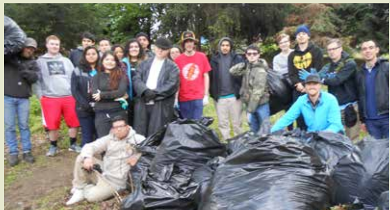
DeLaSalle students at Old Oak site in Baltimore Woods

Somehow a major infestation of herb Robert (also known as "stinky Bob") filled much of the site around our plantings. Green is not always good. Plants that look pretty in the garden, like dames